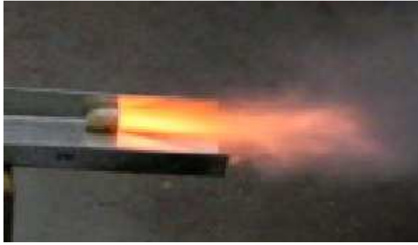
A sample of the propellant burning