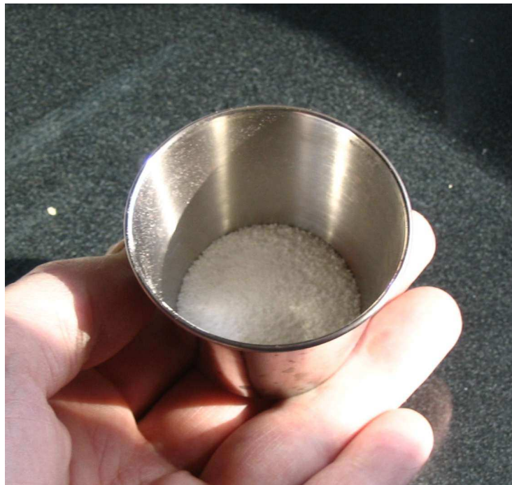
A sample of the granulated propellant used for residual moisture measurement

http://sugarshot.org/downloads/prop-burn-ex2.avi