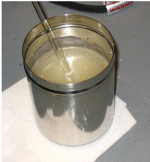
Transfer vessel with \text{KNO}_3/\text{H}_2\text{O} /sorbitol solution