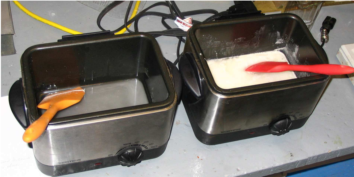
Left to right: Sorbitol in heater, \text{KNO}_3/\text{H}_2\text{O} in heater.